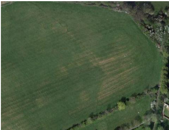
Our diamond from space...

It is important that the club officers know what your intentions are this season. It helps a great deal in our planning. Please fill in the membership-form accompanying this newsletter and send it to the treasurer soon.