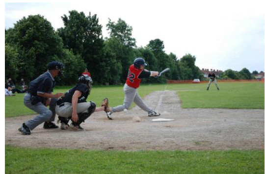
it would be nice if it could show up before it disappears!